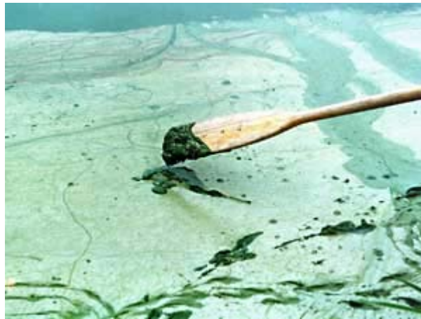
Figure 5. Blue-green algae.