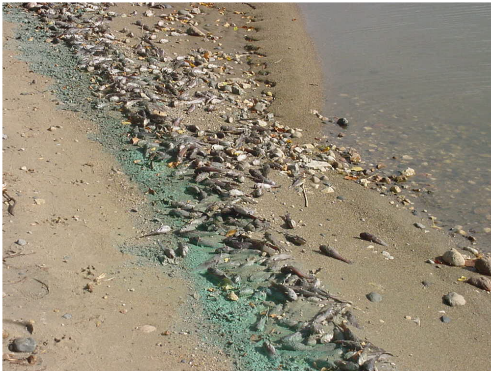
Figure 6. Photo of Lake Benton (Minnesota) Fish Kill, September 27, 2004.

A large fish kill on Lake Benton, in Lincoln County, Minnesota was caused by excessive algal growth. 81