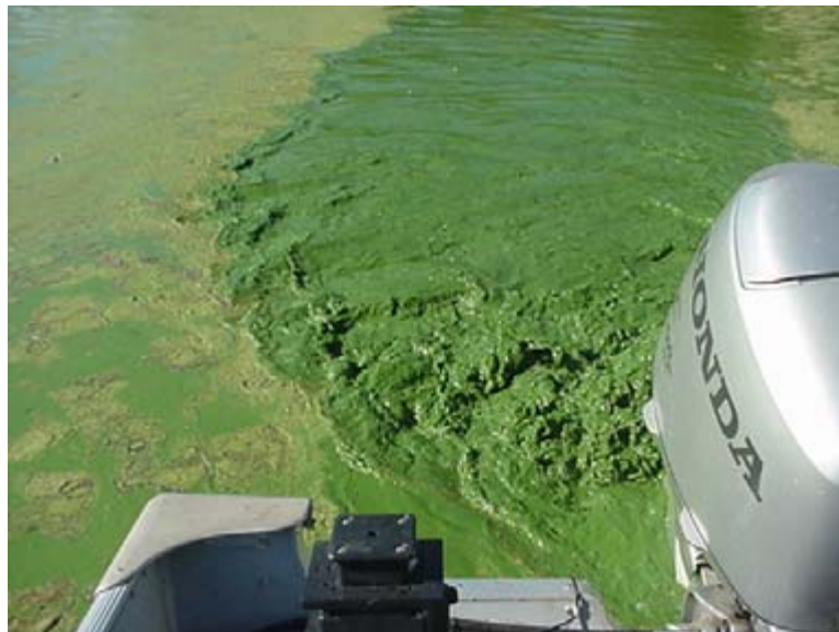
Figure 9. Algae, Wisconsin Department of Natural Resources.